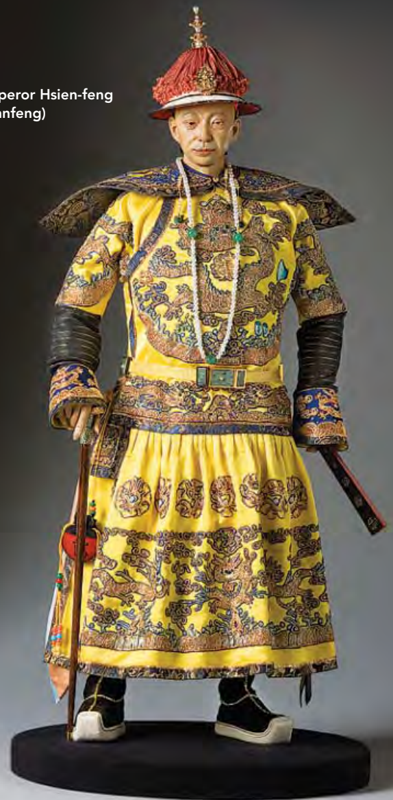
Emperor Hsien-feng (Xianfeng)