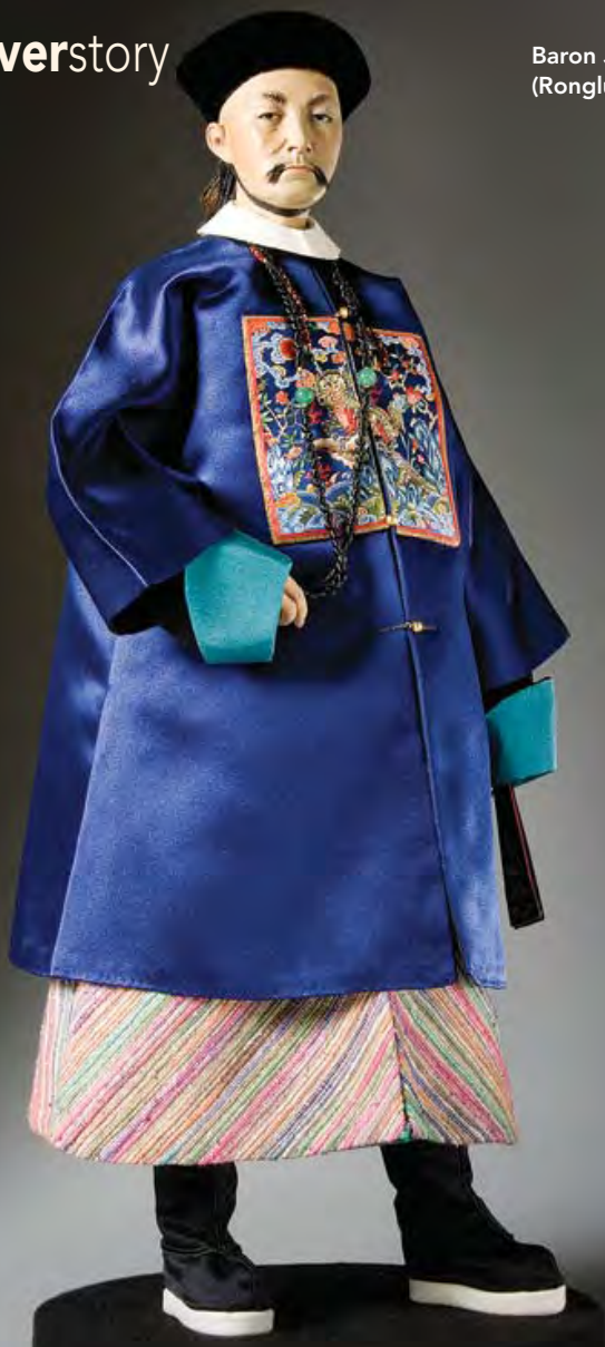
Baron Jung-Lu (Ronglu)