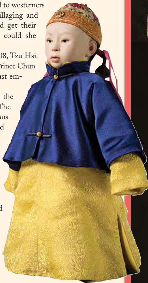
PuYi aka. Xuantong Emperor