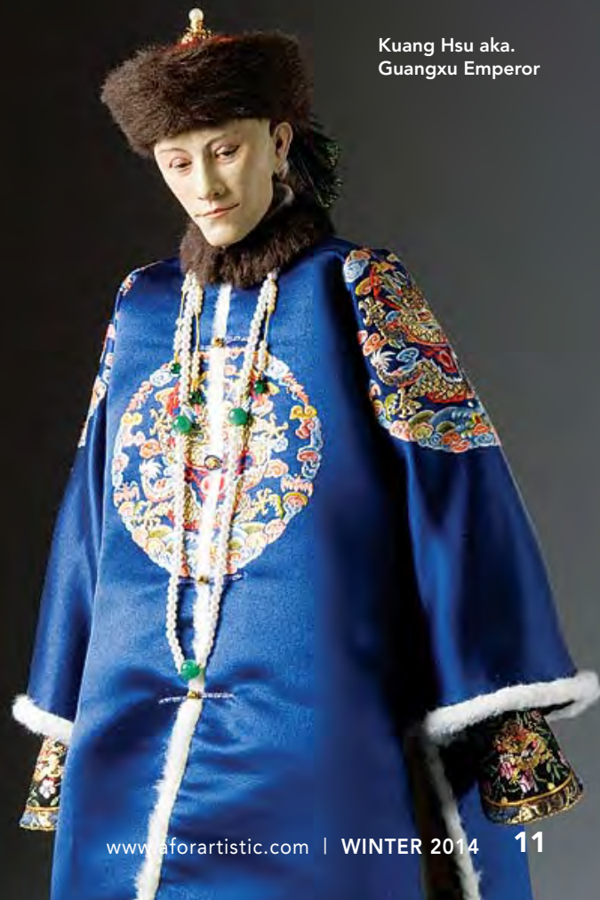
Kuang Hsu aka. Guangxu Emperor