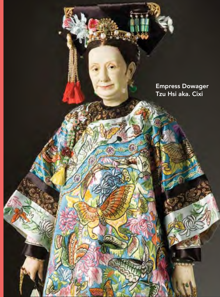
Empress Dowager Tzu Hsi aka. Cixi