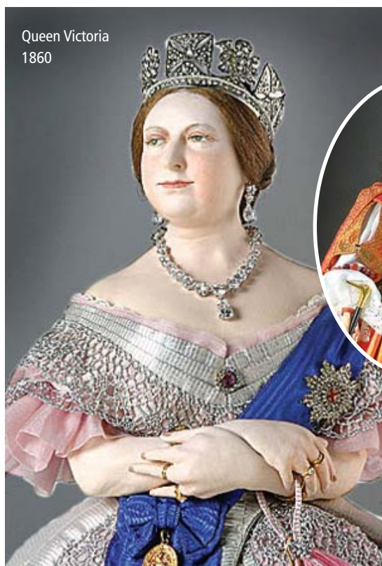
Queen Victoria 1860