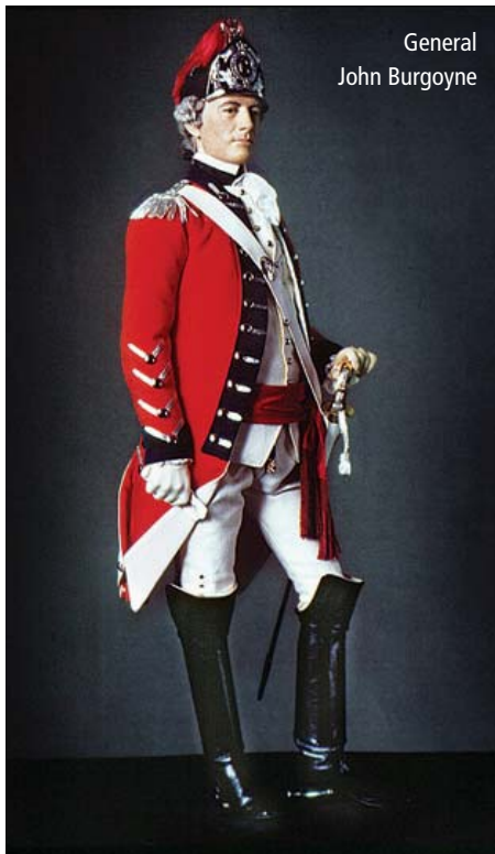
General John Burgoyne