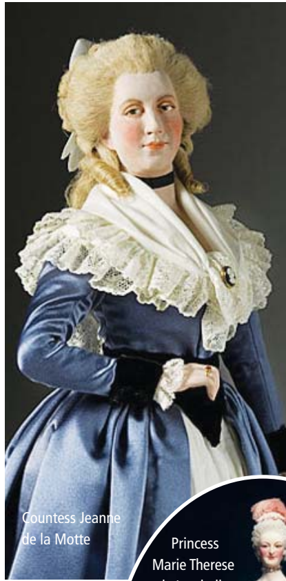
Countess Jeanne de la Motte