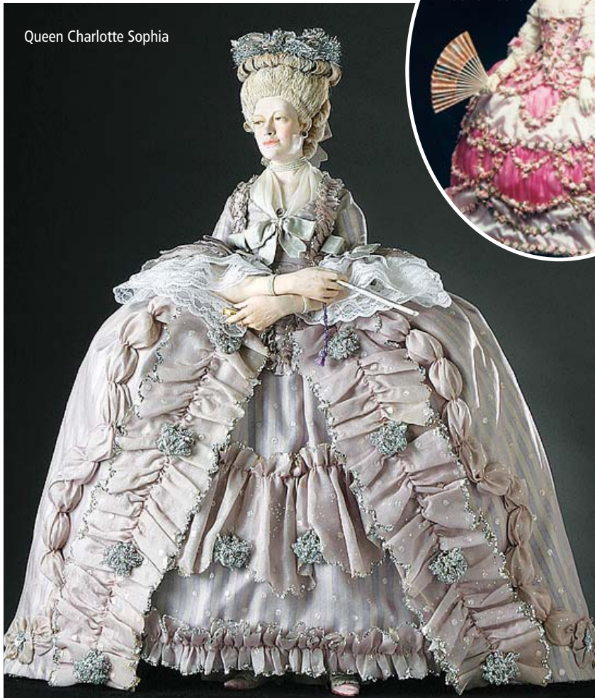
Queen Charlotte Sophia