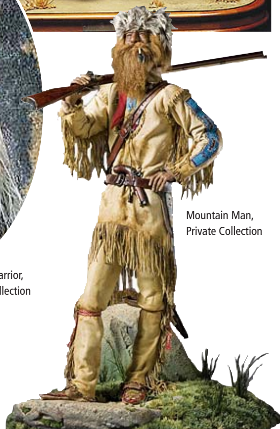
Mountain Man, Private Collection