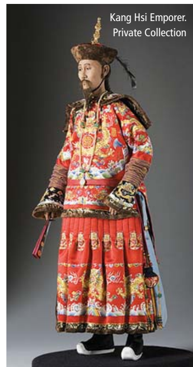
Kang Hsi Emperor. Private Collection