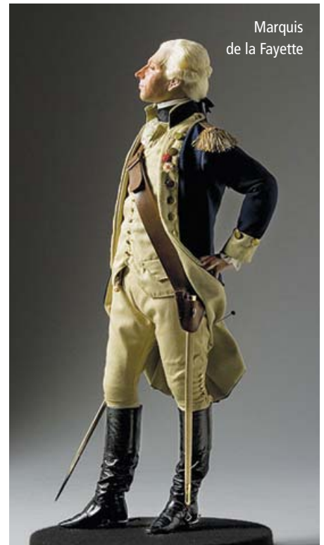
Marquis de la Fayette