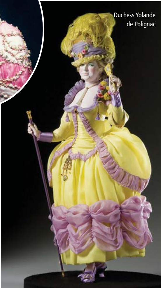
Duchess Yolande de Polignac