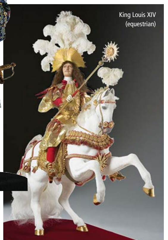
King Louis XIV (equestrian)