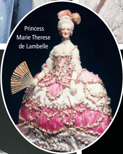
Princess Marie Therese de Lambelle