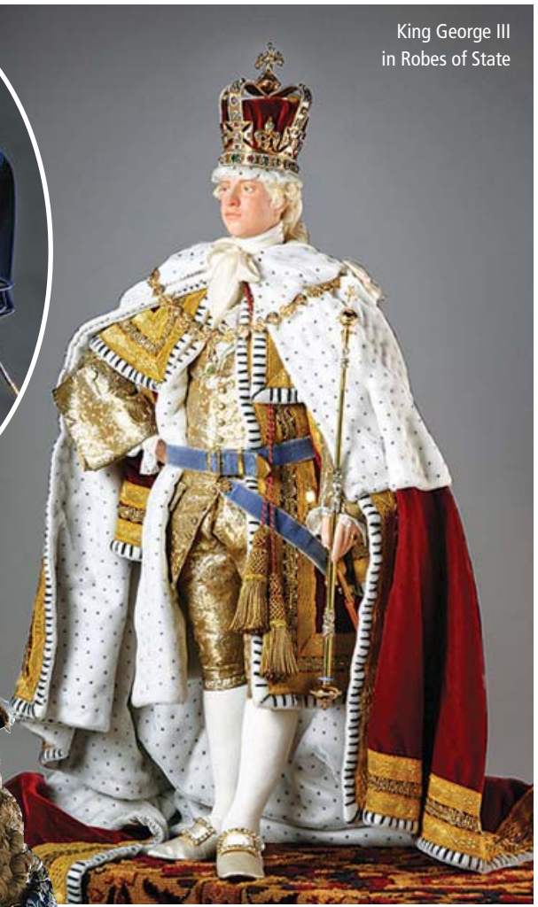
King George III in Robes of State