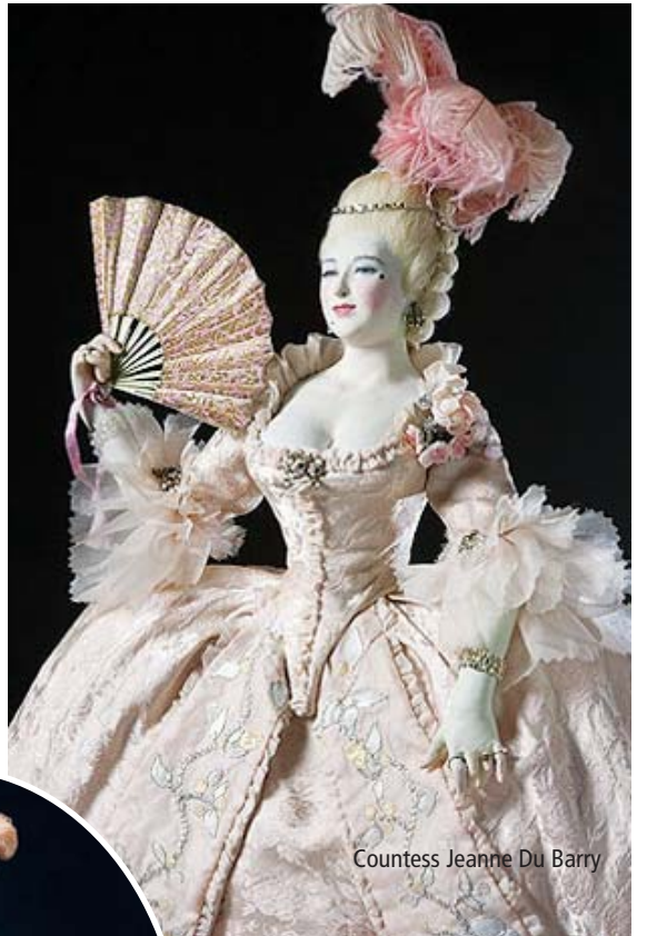
Countess Jeanne Du Barry