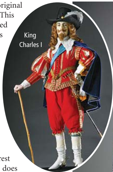
King Charles I

One aspect of the Stuart Figures that sets them apart from many others is Stuart's emphasis on making one-of-a-kind pieces, executed in exacting detail. In a culture where handcraft has virtually disappeared for the average citizen and where small detail skills are often overlooked in the noisy environment of modern life, an appreciation for this non-traditional art form is enjoying a remarkable renaissance.