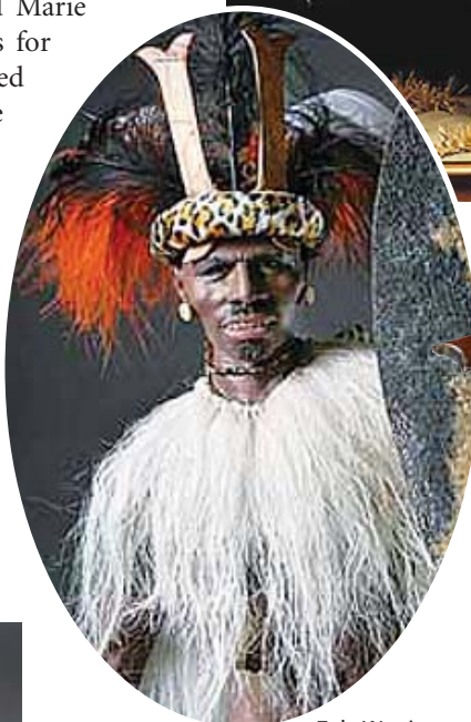
Zulu Warrior, Private Collection