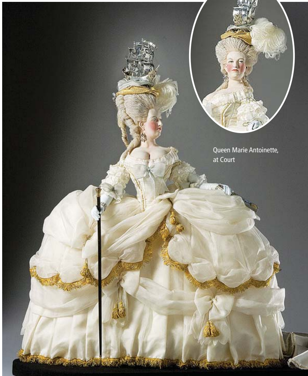
Queen Marie Antoinette, at Court